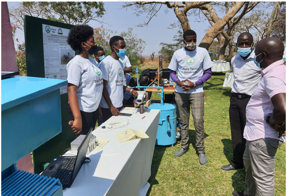
BSc. Mining Engineering students presenting their innovations during the 3 rd International Centre of Excellence for Mining, Environmental Engineering & Resource Management (CEMEREM) Conference in 2021, at Taita Hills Safari Lodge & Spa.